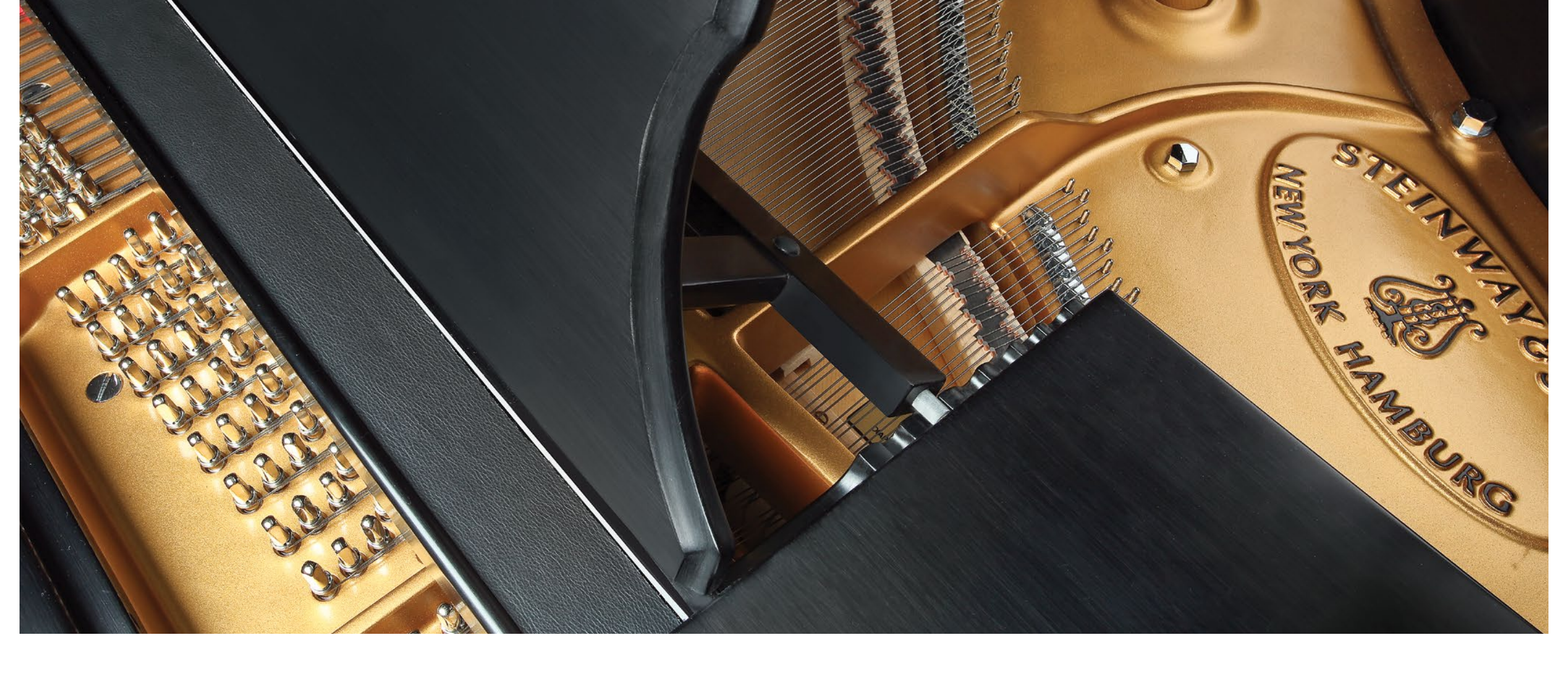
"There is a constancy, not only with the house of STEINWAY, but with their beautiful pianos."