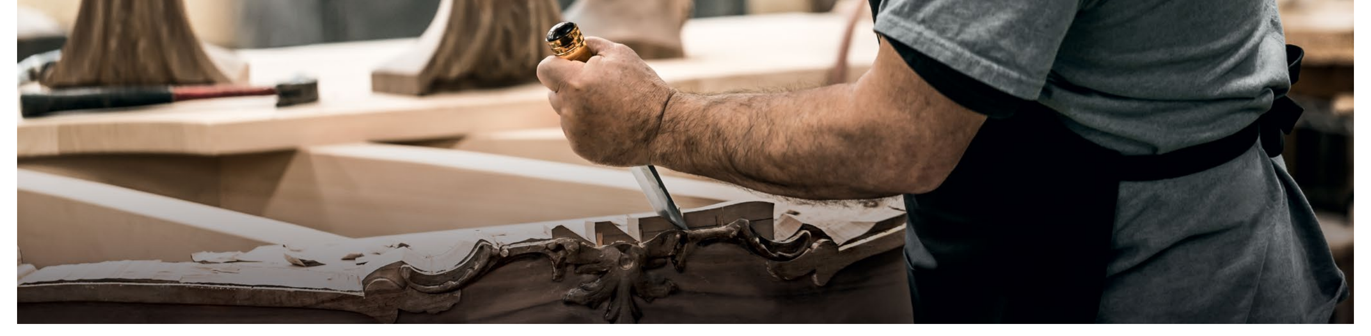
"It takes two individualities, two beings for chemistry to happen.

Thank you for providing pianos that have personality and, even more importantly, soul."